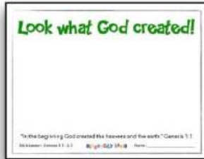
Lesson 1 - Art "Look what God created" activity sheet