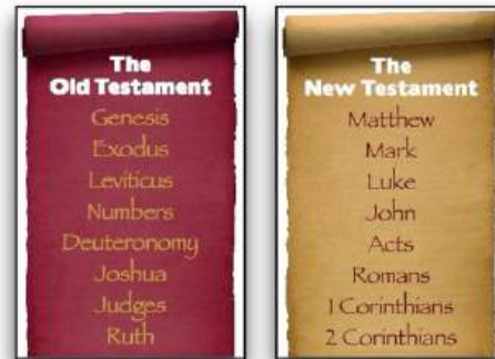
Topical Lesson: The Bible is Truth Opt 2 - Books of the Bible posters