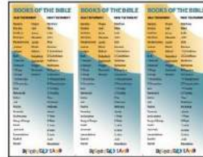
Topical Lesson: The Bible is Truth Opt 1 - Books of the Bible bookmark